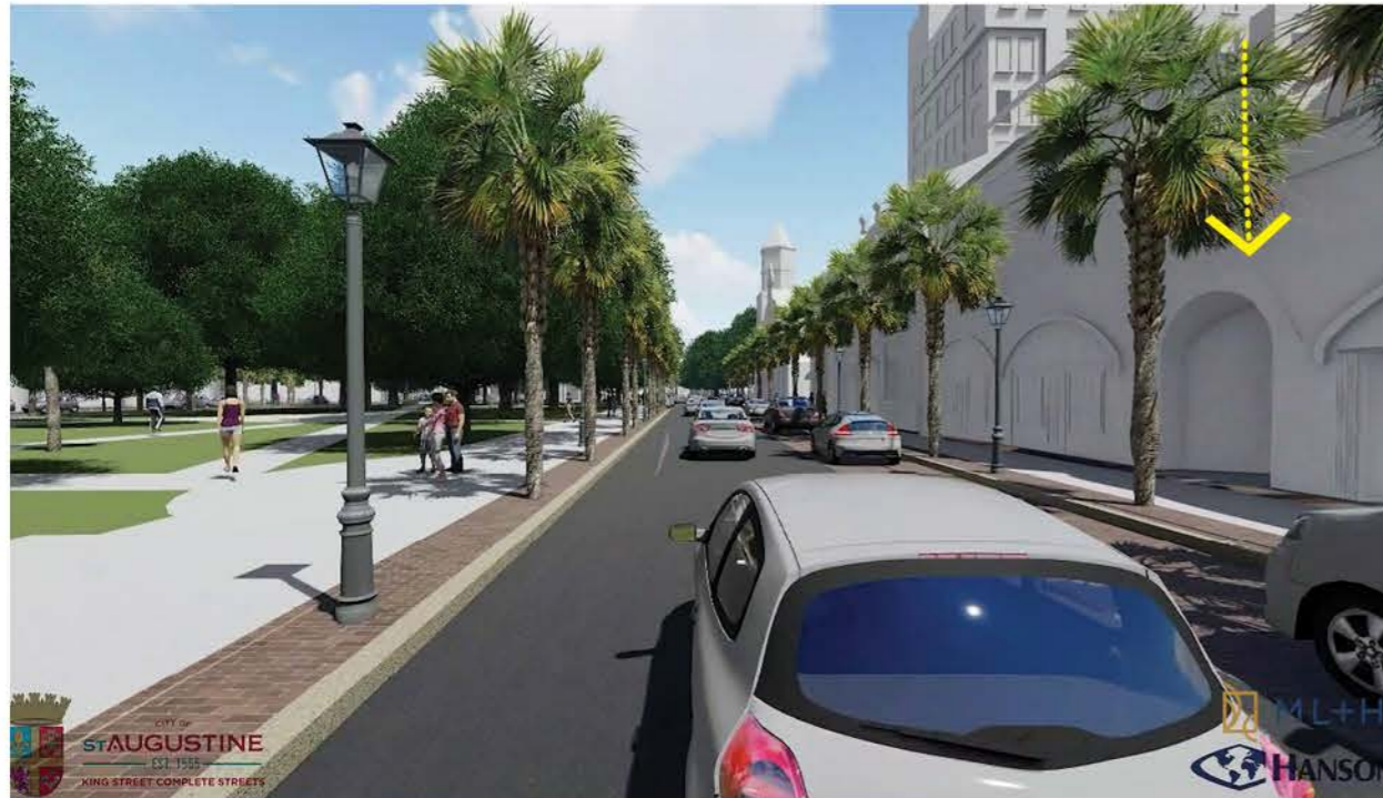
Concept A rendering shown above. Additional renderings for Concept A and B are available on the project website.