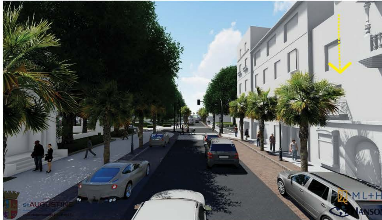
Concept A rendering shown above. Additional renderings for Concept A and B are available on the project website.