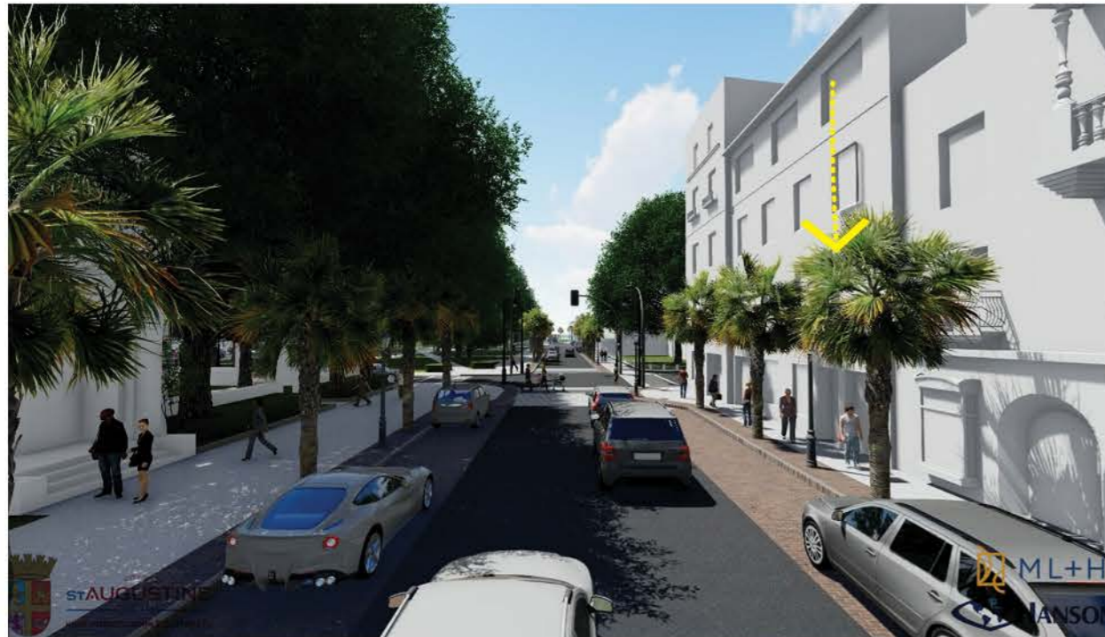
Concept A rendering shown above. Additional renderings for Concept A and B are available on the project website.