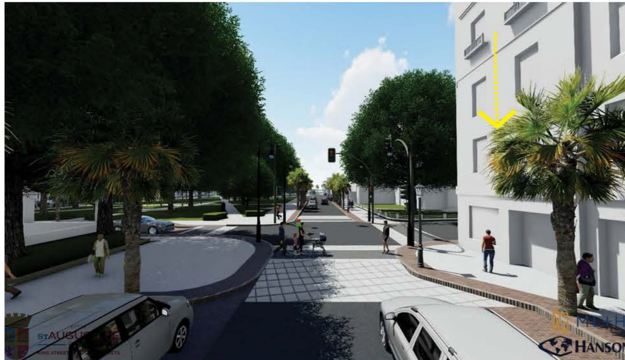
Concept A rendering shown above. Additional renderings for Concept A and B are available on the project website.